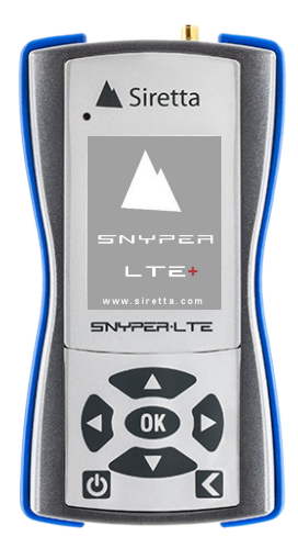
* Neither V1 nor V2 models require a SIM in order to function.

4G/LTE, 3G/UMTS & 2G/GSM Network Signal Analyser